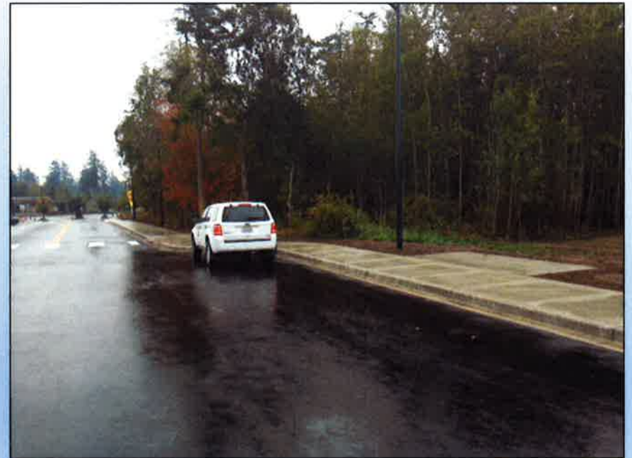
Across from Goodwill Store