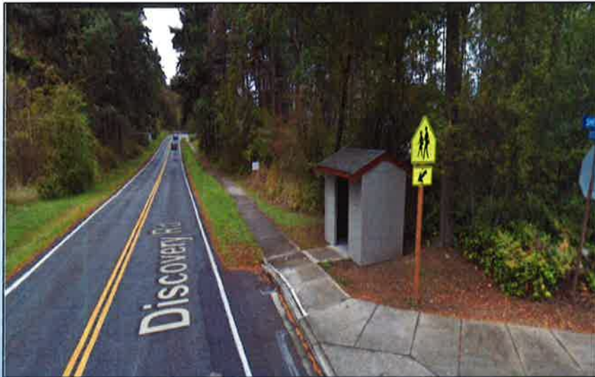
Across from School on Discovery